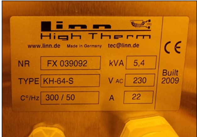
type plate Linn High Therm KH-64-S